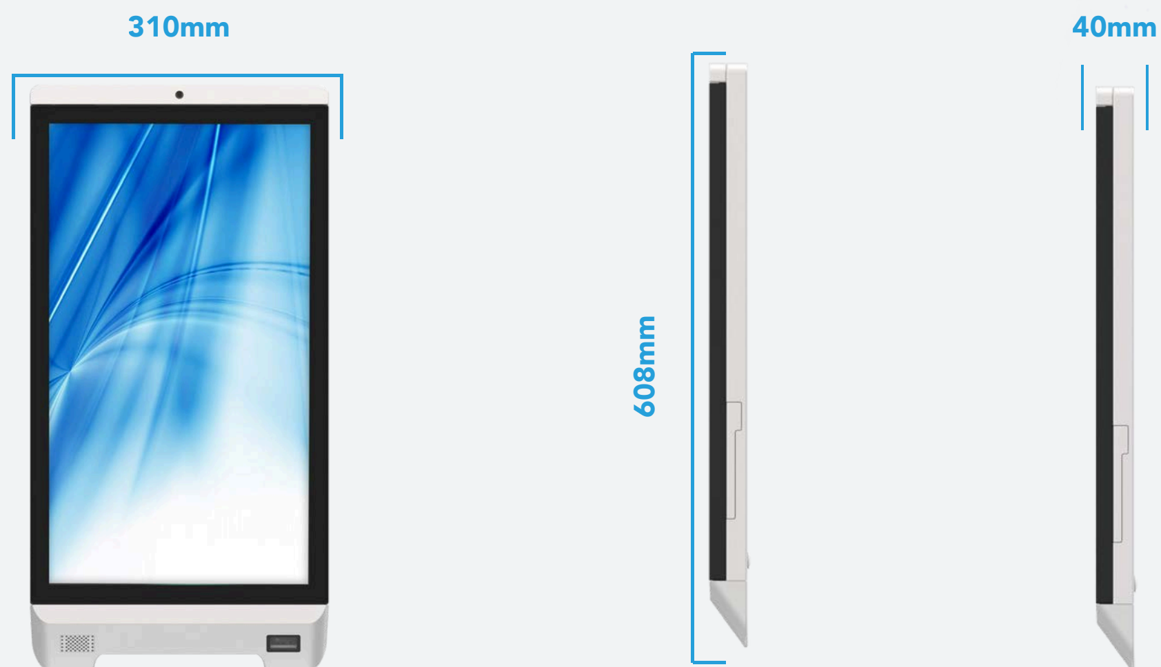
Wall mount (optional)

Space-Saving Design – The Element Nova 500 features a compact, 40mm thick profile, making it a versatile kiosk solution. Its slim design allows for easy integration into various settings, including retail shops, food & beverage venues, hotels, entertainment spaces, and healthcare environments. The benefits of the Nova 500 include its ability to save valuable space while offering flexibility in installation. Its sleek appearance complements diverse environments, and its adaptability ensures it meets the needs of different industries, enhancing functionality without compromising on style.