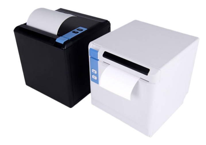
Front or Top Paper Loading / Exit