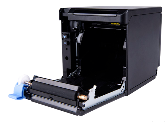
2" and 3" printing paper width available