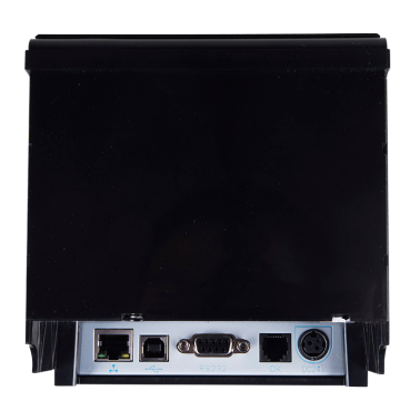
Standard (USB/ Serial/ Ethernet/ Bluetooth/ Wi-Fi)