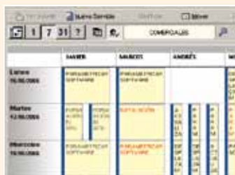
Management of services and activities