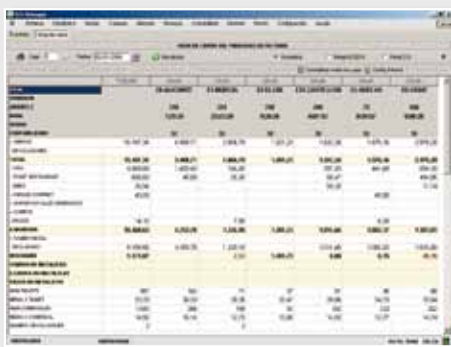
Closing sheet of a chain of establishments