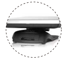
Flat Folded Mode