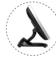
Full Extended Mode