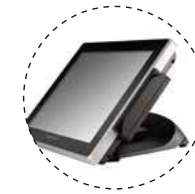
Low Profile Mode