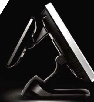
With 2nd display LCD